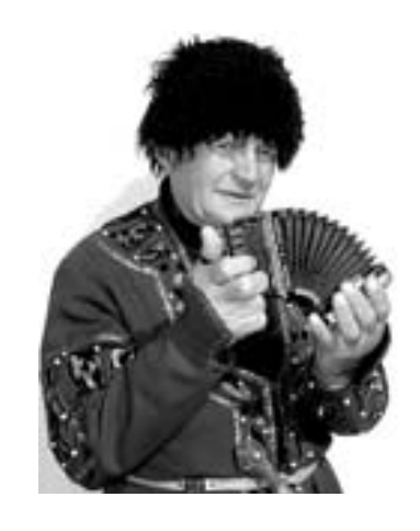
At the Folk Exhibition Festival

Among the participants of the Symposium's concert program were Anchiskhati Church Choir, Basiani , Mzetamze , students' folk ensemble of Tbilisi State Conservatoire, Mtiebi , Rustavi , Sakhioba , singers of the Youth School from Samegrelo, women's chamber choir from Gori (all from Georgia) and visiting ensembles Iruska , Marani and Irinola (all three from France), ensemble Darbazi and trio Zari (from Canada), ensemble Maspindzeli (UK) and Geinoh-Yamashirogumi (Japan).