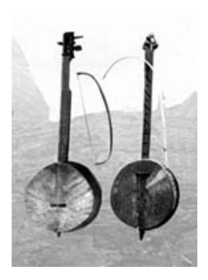
Chuniri and Chianuri

It is very difficult to define when chianuri was introduced as the name of an instrument. It should be taken into consideration, that in folk poetry we often come across the term kamancha ( kemanche ) meaning a bowed instrument; thus it can be presumed, that the bowed construction was first introduced to Georgia from Persia, and only when the instrument had undergone reconstruction according to Georgian tunings and established its place in Georgian music instrumentarium, it was given the name chianuri.