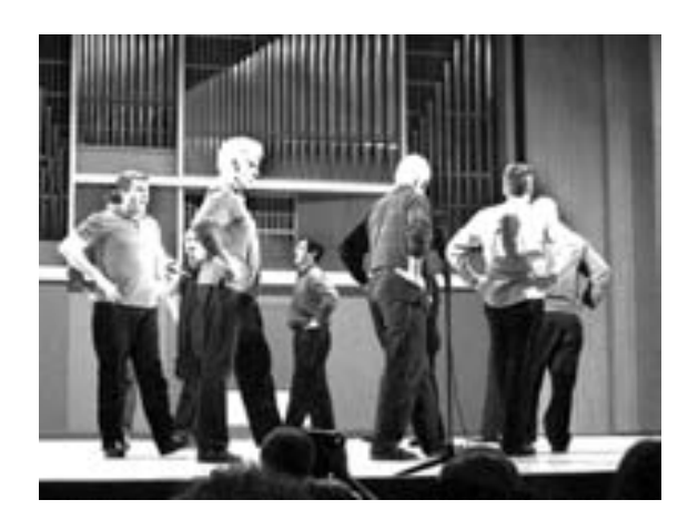
Ensemble from Canada Darbazi

lue our relations with these ensembles very much.