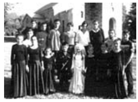
International Festival Chveneburebi Ensemble from Saingilo (Azerbaijan)

September 30-October 2. Tbilisi Opera House hosted the final round of the National Exhibition-Festival (2005-2006) and the concert with the participation of the laureates. The participants were selected by the jury during local, regional tours of the Festival. This was held with the support of