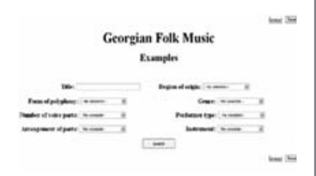
The online version of the database