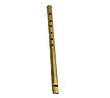
Adyghe wind folk instrument Kamyl

Shichapshin is an Adyghe string-bowed folk instrument, which is used as an accompaniment to the songs of many genres. It accompanies solo songs related to working process: "Bear Head", "Ox-cart Driver's song", "Kabardian". In the latter, the instrumental part sometimes follows the song in unison, and sometimes it is two-part – the bass against the background of an instrumental transcription of the vocal part; it is rhythmically developed and characterized in fourth consonants at the beginning and end of phrases.