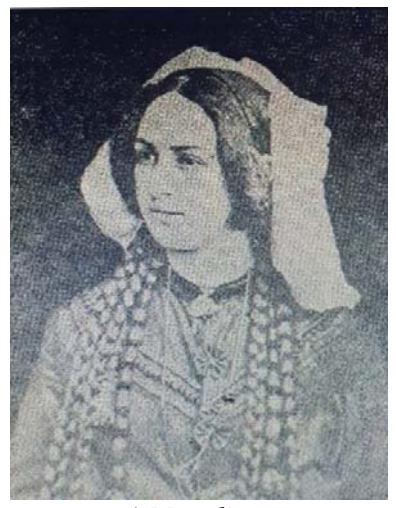
A Megrelian woman

"inspection" mostly took place at night, so that the villagers did not know, as in the case of refusal, the woman would be dishonored, thus this was kept in secret. To the "inspection" the man was accompanied by his parents and uncle.