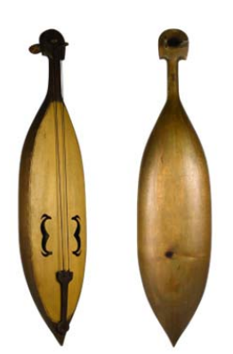
Adyghe string-bowed folk instrument Shichapshin

According to genres Adyghe songs can be classified as: labor songs, ritual and family songs, healing songs-spells, historical-heroic songs, " Nart songs". The latter constitutes a solid part of Adyghe folk music and are nurtured by the "epos of the Narts". This is the name for the epos of the peoples of the Caucasus, referring to the local ancient layer of traditional folk art. The term "nart" is the common name for the epos heroes, who form a peculiar group. Nart epos is a work of heroicadventure genre rich in mythological motifs. It is a multi-plot narrative genre with compositionally bound and solid structure, which conveys heroic adventures of the characters through poetic and prosaic texts.