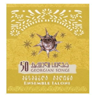
Prepared by Sopiko Kotrikadze

Ensemble Ialoni released the audio album "50 Georgian Songs"